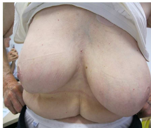
Figure 4 Photographies of patient #3 with 60 months of follow-up.

The fourth local event was a second 3-mm primary ductal carcinoma located in another quadrant and diagnosed 3 months after the surgery. The RADELEC scientific committee considered this event as a second primary tumor omitted during the preoperative staging (staged only by ultrasound).