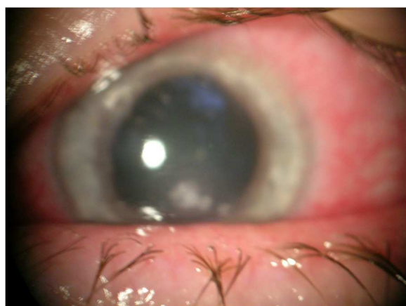
Figure 1 Dolosigranulum pigrum keratitis in patient n1. Central corneal whitish infiltrate at patient's initial presentation.

simplex virus (based on the 18S rDNA, rpoB and DNA polymerase genes, respectively) were negative. Ten days after initial examination, the corneal scraping however tested positive for 16S rDNA in the presence of negative controls and sequencing the 16S rDNA PCR product yielded 982/990 bases (99%) and 881/881 bases (100%) sequence similarity with the homologous sequence of D. pigrum reference strain (GenBank X70907) and with D. pigrum clone 6113702 (GenBank EF517957.1) and only 93% with the following identified species Alloiococcus otitis .