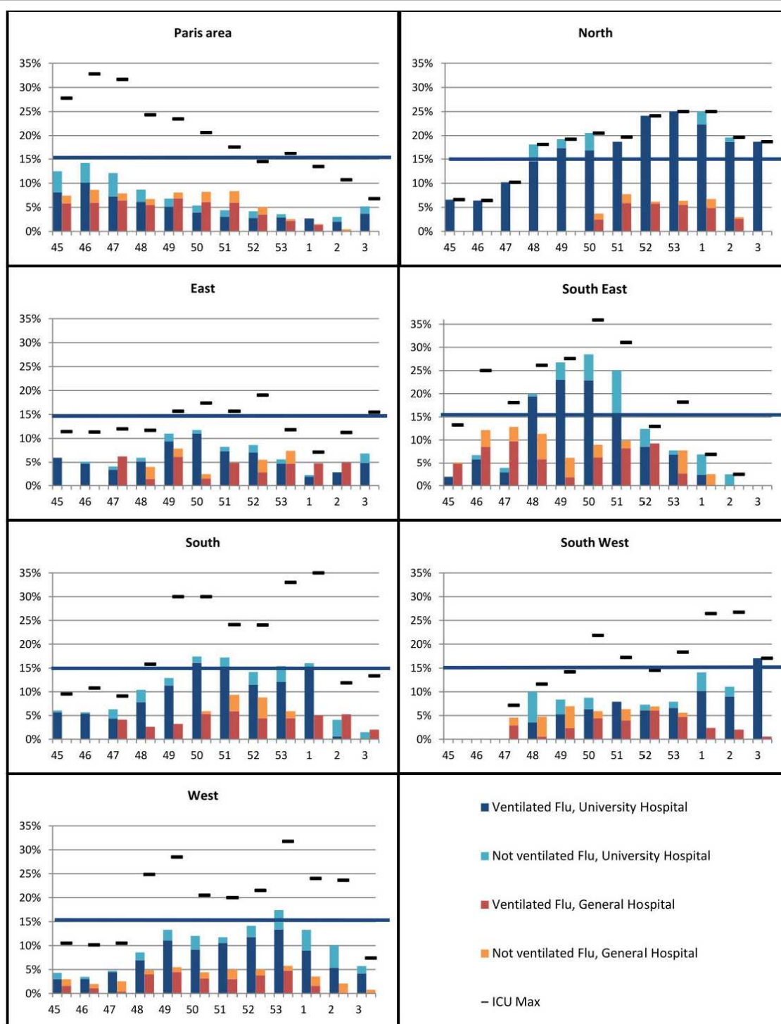
Figure 3 Rate of intensive care unit (ICU) bed occupancy by flu-infected patients in the seven 'defense areas'. For each defense area, the table shows the weekly occupancy rate (from week 45 of 2009 to week 3 of 2010) according to the type of ICU (university or non-university) and the rate of ventilated and non-ventilated patients. The black marks indicate the maximal occupancy rate of an ICU of this area.