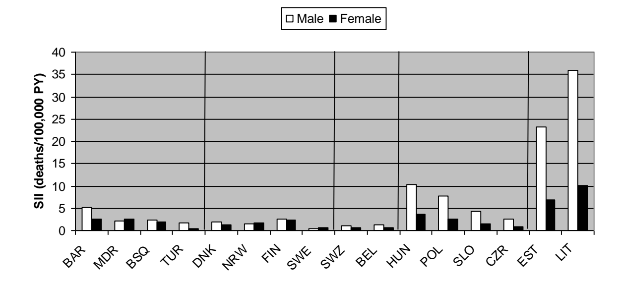
Figure 2. Absolute educational differences in tuberculosis mortality rates, expressed as the slope index of inequality (SII).