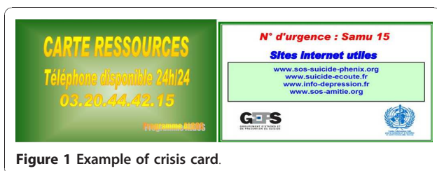
Figure 1 Example of crisis card.

Telephone contact will be abandoned, if unsuccessful after at least 3 call attempts on 3 different days at 3 different daytimes, and sending "postcards" will be scheduled for the next 5 months.