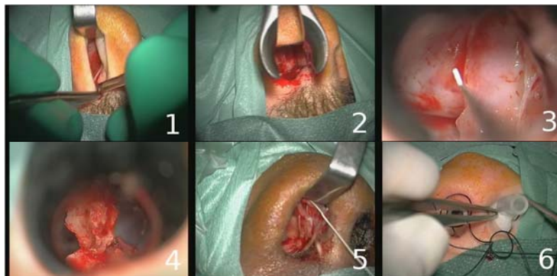
Fig. 1. Example of typical digital microscope images for the six phases: 1) nasal incision, 2) nose retractors installation, 3) access to the tumor along with tumor removal, 4) column of nose replacement, 5) suturing, 6) nose compress installation.

Our project is currently composed of 16 entire pituitary surgeries (mean time of surgeries: 50min), all performed in Rennes by three expert surgeons. Videos were recorded using the surgical microscope OPMI Pentero (Carl Zeiss). The initial video resolution was 768 x 576 pixels at 33 frames per second. Recordings were obtained from nasal incision until compress installation (corresponding to the microscope use). From these videos, we randomly extracted 400 images which were supposed to correctly represent the six phases of an usual pituitary surgery. These phases, which were validated by an expert surgeon, are: nasal incision, nose retractors installation, access to the tumor along with tumor removal, column of nose replacement, suturing and nose compress installation (Fig. 1). Each image of the database was manually labeled with its corresponding surgical phase.