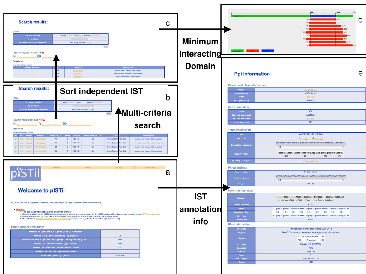
Figure 3 pISTil web interface screenshots. Complete details on how to use the interface is given in the pISTil documentation [see Additional file 1]. a - Home page: http://pbilddb1.univ-lyon1.fr/pistil/ . b - Multicriteria search result page: http://pbilddb1.univ-lyon1.fr/pistil/search.php?bybait=NS2&searchprey=&searchterm=&fbproject=all&search=l . c - Search independent IST result page: http://pbilddb1.univ-lyon1.fr/pistil/repeat.php?bybait=NS2&searchprey=&searchterm=&fbproject=all&search=l . d - Interaction domain result page - http://pbilddb1.univ-lyon1.fr/pistil/mid.php?bait=NS2&ist=NP_001026884&plateid=2 . e - PPI information result page - http://pbilddb1.univ-lyon1.fr/pistil/ppi.php?ppi=l65&anal=t%23%23refseq%23refseq_human_prot .