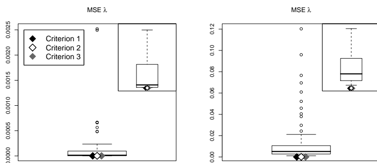
FIG 1. Box-plot of the MSE_{fs} of all possible m in fixed strategy together with the MSE_{ms} of three criteria in Model 1 with g(\lambda) = \lambda for \lambda = 1 (left) and \lambda = 20 (right); black diamond for the first criterion, white diamond for the second criterion and grey diamond for the third.

The mean square errors for the fixed strategy and the modulated strategy for g(\lambda) = \lambda are presented in figure 1 with \lambda = 1 on the left and \lambda = 20 on the right. Black, white and grey diamonds correspond to the first, second and the third criteria respectively for the modulated strategy. The box-plots give results for the fixed strategy when all possibilities of fixed m are considered. Box-plots without outliers (extreme MSEs) are presented in the top right corner of each graphic. We observe that mean square errors are greater for \lambda = 20 as data variability is