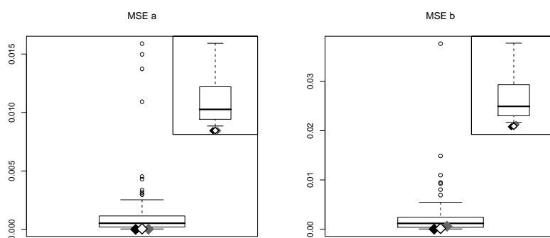
FIG 2. Box-plot of the MSEs of all possible fixed choices together with the MSEs of both criteria in Model 2 with \theta = (a = 0, b = 0.5) for g(\theta) = a (top left) and g(\theta) = a^2 (top right), g(\theta) = b (bottom left) and g(\theta) = b^2 (bottom right); black diamond for the first criterion, white diamond for the second criterion and grey diamond for the third.