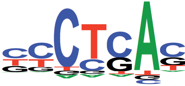
Figure 1. Branch point matrix. The size of each nucleotide is proportional to its weight in the position weight matrix. Nucleotides above the base line have positive values while nucleotides below have negative values.

Since many intronic sequences match the BP consensus sequence, we included the AG-Exclusion Zone algorithm described by Gooding et al. (25) to predict BP candidates. For a given intronic sequence and its intron-exon boundary, HSF searches all AG dinucleotides that are included in a 3'ss candidate sequence (threshold of 67) and therefore define the exclusion zones. As it has been shown that the BP allows the recognition of the first downstream 3'ss, HSF annotates the functional BP as the strongest candidate without a 3'-exclusion zone before the natural 3'ss.