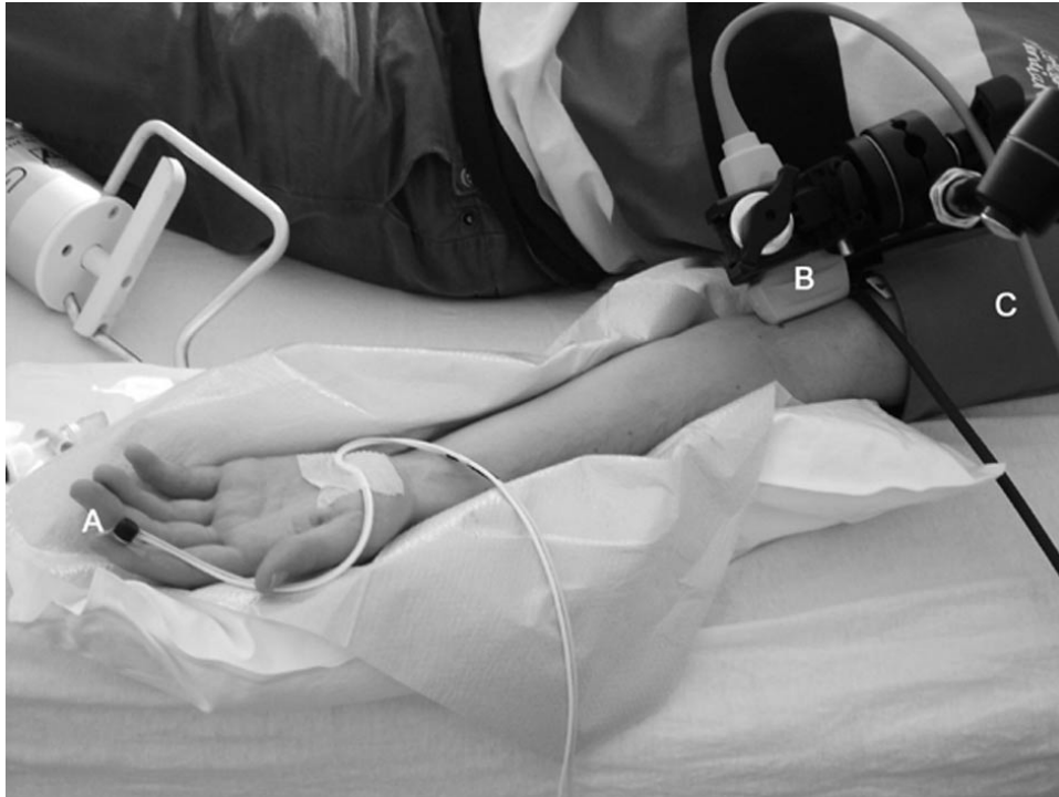
Figure 1. Simultaneous recording of digital skin microvascular and brachial artery macrovascular hyperemia after a 5-minute occlusion of the brachial artery. A: Laser Doppler probe; B: ultrasonography probe; C: pressure cuff.