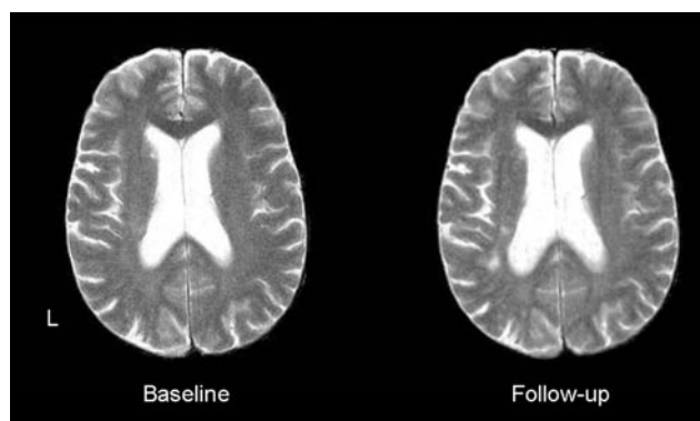
Figure 2. Illustration of the technique used for MRI assessment. On the left side of the Figure, there is an axial T2-weighted image of first MRI examination of a PROGRESS patient. On the right side, the image is taken from the second examination performed at the end of the follow-up. With registration techniques and histogram equalization, it was possible to make this second examination as similar as possible to the first examination, as seen in the Figure, thus facilitating the comparison between the 2 examinations by the neuroradiologist. Despite the small loss of resolution in the second examination due to the technique, it is possible to visualize new lesions close to the left occipital horn.