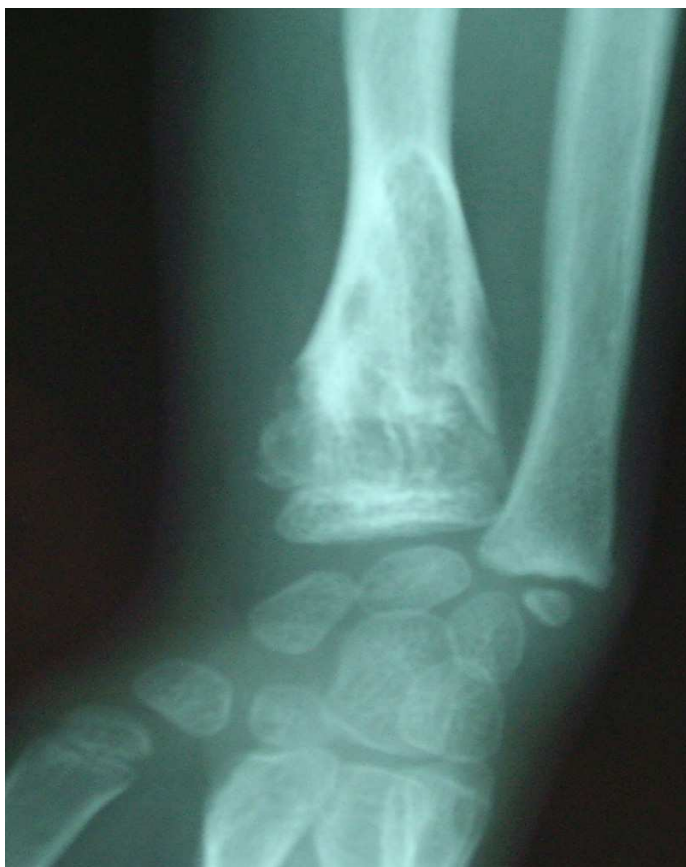
Figure 1 Roentgenographs showing enchondromas localized in the upper part of the humerus (fig 1a and lower part of the radius (fig 1b) of a girl 7 years of age affected with Ollier disease.